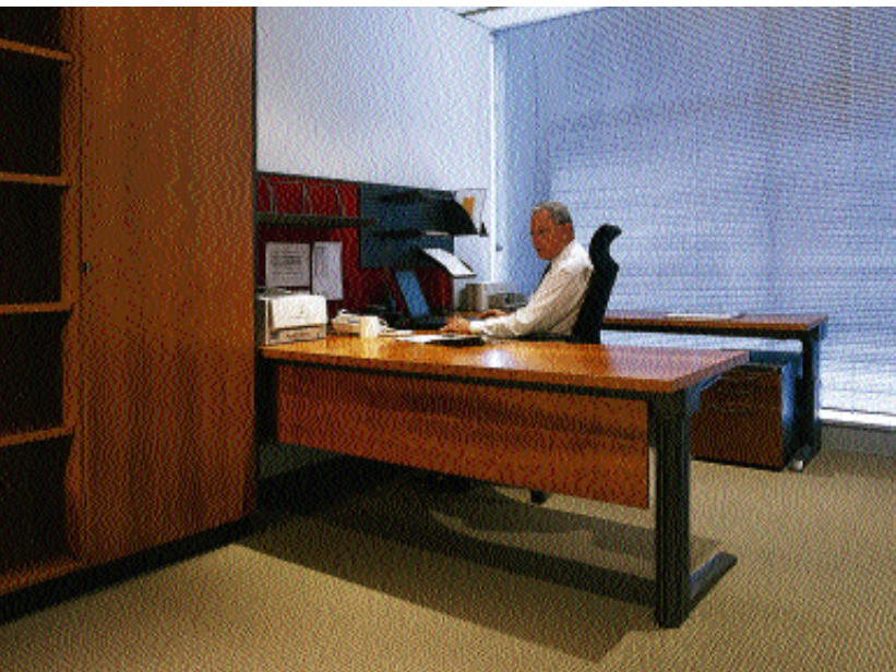
Below Photo> Newtech desking in veneer for executive areas.

"I think you've given us a great corporate presence - it's very warm, friendly and inviting, and the clusters of workstations really encourage a team spirit," he concluded, "I've got to take my hat off to Schiavello, they exceeded all of our expectations."