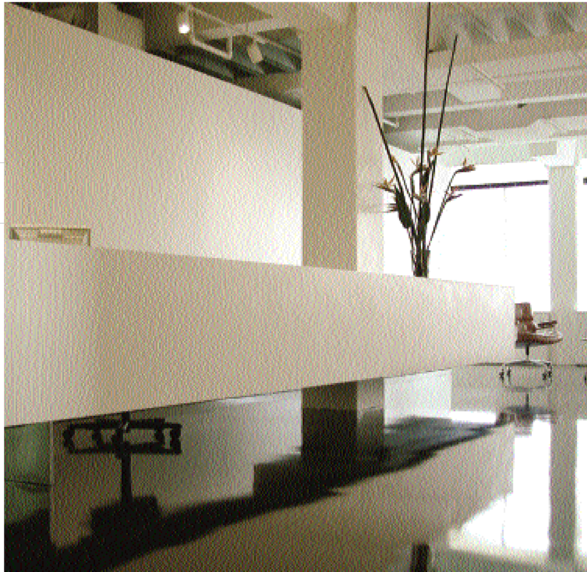
Above Image The black epoxy resin floor, contrasting with the satin white counter proves to be a striking reception lobby for Bates Smart.