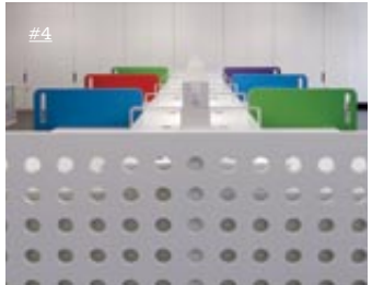
#4 Office expanse featuring Ultimet workstations + Systemet mobile storage.