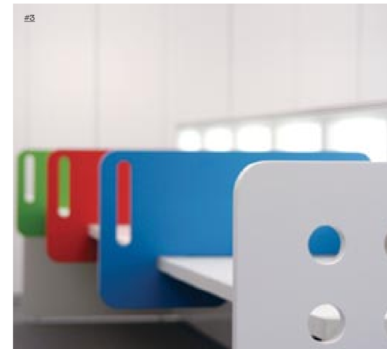
#3 Detail of coloured MDF desk dividing panels.

Project details Project location Levels 6 + 7, 77 Pacific Hwy, Nth Sydney Client Yahoo! Australia & NZ Design WHOdesign - Todd Hammond Project management DTZ Australia Schiavello Systems NSW Ashlee Marshall, Serge Mezzina Area 1200 sq.m. Products Ultimet workstations, Systemet storage.