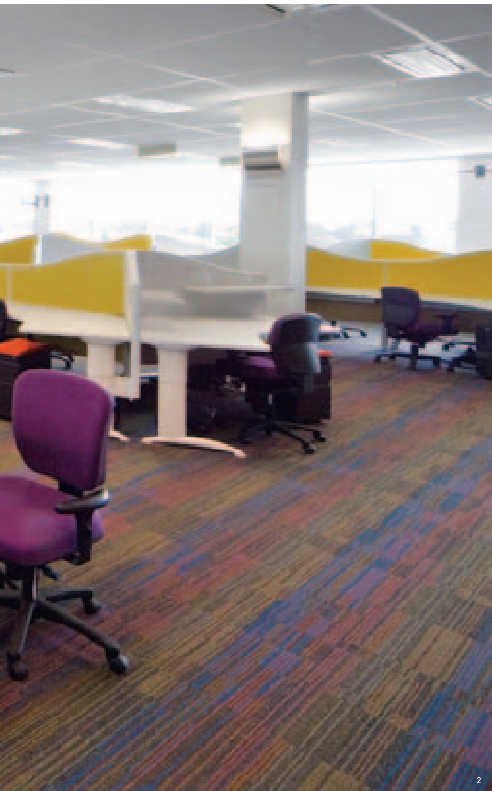
1_Large open floor plates to suite workspace modules lit by a central atrium. 2+3_Open work areas featuring the Elitone desking system + System 55 curved dividing panels, Systemet cushion-topped storage pedestals + Novetta seating. 4_Schiavello's MK 9 glass partitioning system to offices.