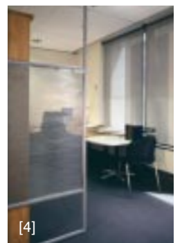
Above [1] ... Typical work setting featuring Ultimet veneer spines providing power + data reticulation with a knowledge spine - a series of book cases with integrated white boards + reference shelves. [2]... Client floor boardroom featuring Liberty seating - a total of 120 chairs were supplied in the board + meeting rooms. [3] ... Viewshafts inset into strategically placed knowledge spine units offer workpoints on the internal core, a link with the external panoramic views and natural light filtration. [4] ... Custom made privacy screens help delineate space in an open environment.