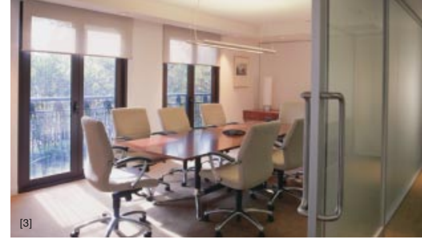
Opposite [1] ... Custom made low height plaster joinery unit - purely a design feature for the entrance. Above [2] ... Office area features desk, meeting table, credenza unit + veneer shelving joinery. Full height custom made glazed sliding door + glazed partitions. [3] ... Boardroom featuring full height custom made walls, partitions + glazed sliding door. Boardroom table + credenza by Prima Architectural. Uniflex seating.