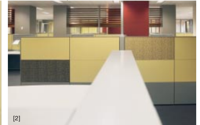
Above [1] & [2] ... Open work areas feature Unimet workstations with cantilevered worktops, powerblades with feature light boxes, Systemet storage, and Novetta seating.